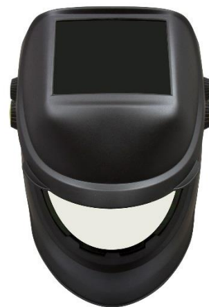
Large Inner Visor